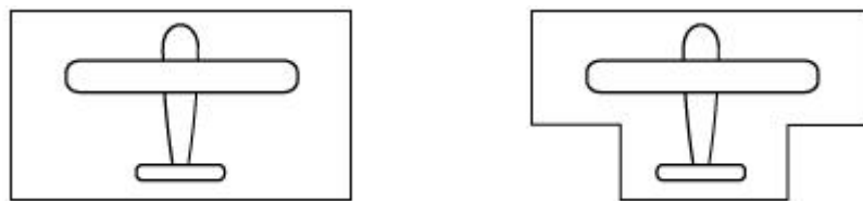
FIGURE A.4.1.3(a) Freestanding Units for Single Aircraft.

Figure A.4.1.3(a) through Figure A.4.1.3(c) are examples of Group III aircraft hangars.